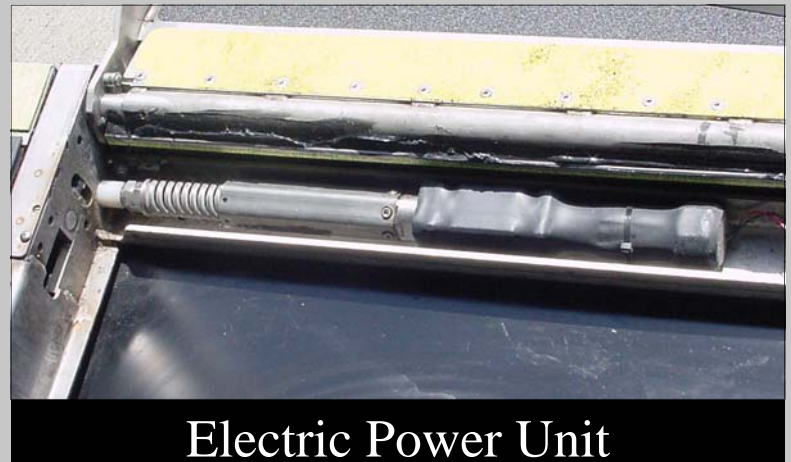
Electric Power Unit

The ramp is equipped with a stow latch to prevent ramp platform movement while stowed. The stow latch includes a simple pull handle manual release feature for emergency operation.