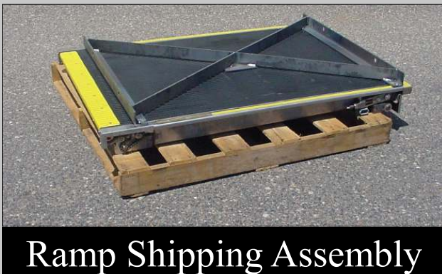
Ramp Shipping Assembly

U.S. patents apply: 6,602,041; 6,843,635 B2