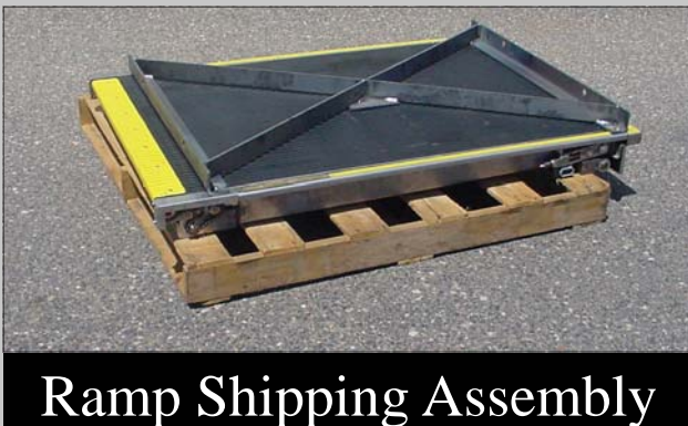
Ramp Shipping Assembly

U.S. patents apply: 6,602,041; 6,843,635 B2