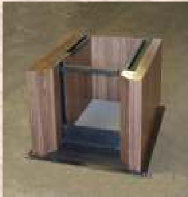
Safety barrier up