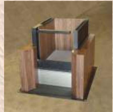
Lift at upper level