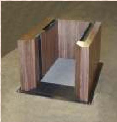
Ready for use

Designed for 24 inch or less low rise applications, such as Churches, Board Rooms, Council Chambers, etc.